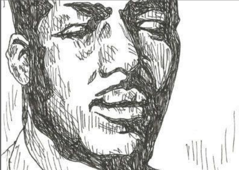
Image of Blind Willie Johnson. In the public domain.